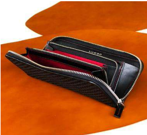
13th LUEGO Yamagata Cow leather color's 5