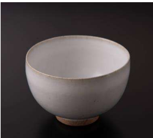
Photo: right. This is a small rice bowl that is easy to hold and use. This simple item consisting of calm colors can be used for a long time and never becomes boring.