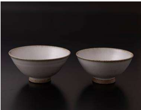
Photo: left. This is a rice bowl that is easy to hold and use. This simple item consisting of calm colors can be used for a long time and never becomes boring.