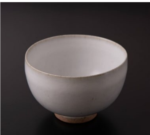
Photo: right. This is a small rice bowl that is easy to hold and use. This simple item consisting of calm colors can be used for a long time and never becomes boring.