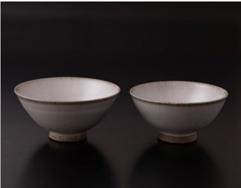
Photo: left. This is a rice bowl that is easy to hold and use. This simple item consisting of calm colors can be used for a long time and never becomes boring.